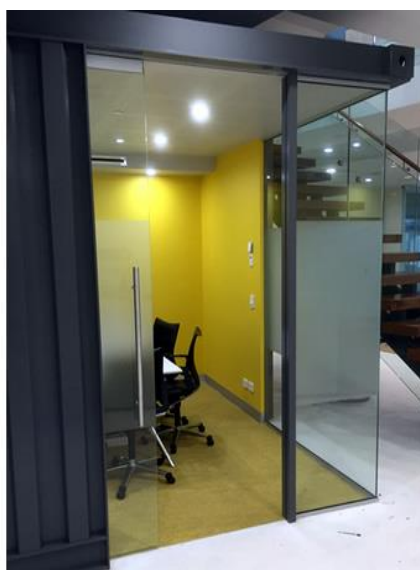
Go-Combo with Glass Door