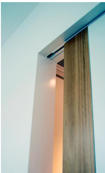
Square Set – Timber Door